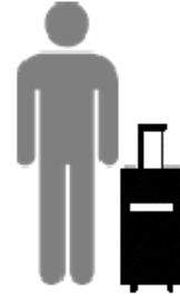
In carry-on baggage