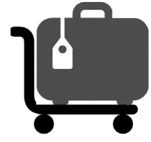
In checked baggage